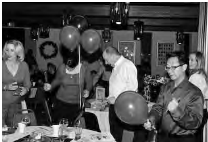
"Pop for Prizes" at the 5th annual silent auction/wine tasting/chocolate challenge